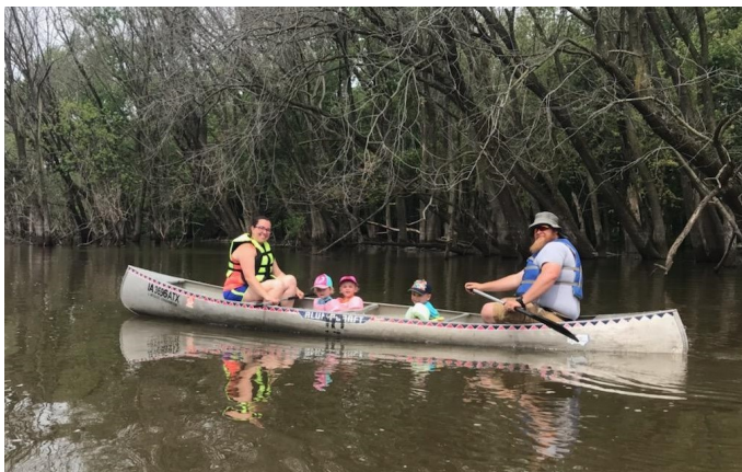
Enjoying a canoe ride with their parents on the backwaters during a Family Camp at Rock Creek.

When our early summer camps were cancelled in June, it was important for us to come up with a safe way for these children to still get their camp experience. That's when the Family Camp evolved.