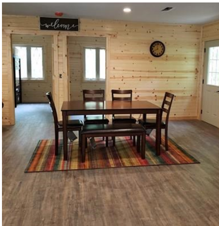
The Cabin at Camp Miss-Elk-Ton. Ready to rent at mycountyparks.com

Pre-sorted STD U.S. Postage PAID CLINTON, IA 52732 Permit No. 164